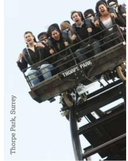
Thorpe Park, Surrey

Marketing must build the profile of the England brand in the world marketplace. Informed by a thorough understanding of the visitor's motivations across target markets, marketing will focus on England's most attractive destinations and experiences. An 'attract and disperse' approach will see England's world famous and exceptional destinations such as London, the Lake District and the Cotswolds among many others, used to attract new visitors who can then be encouraged to explore the richness of England. This approach can be embraced at all levels across the country to ensure that the economic benefits are widely felt. Balanced with this, a collaborative cross-destination approach to marketing England's unique attributes can be adopted. This will position and build England's reputation as a destination which delivers the authentic and world-class experiences visitors demand from internationally renowned built and natural heritage, to the vibrant contemporary culture of England's cities; from adventure to indulgence.