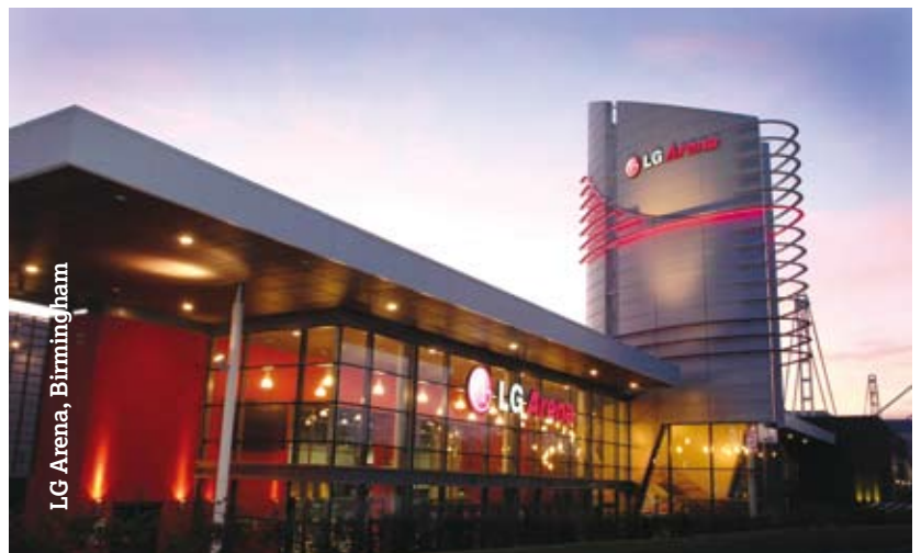
LG Arena, Birmingham

In addition to the considerable economic benefits brought about by business and events visitors, there are other significant advantages to attracting this market. Business visitors travel throughout the year, contribute a higher spend per visitor, are more likely to travel to areas not traditionally known for holiday visits and are more likely to return as high spend holiday visitors in the future.