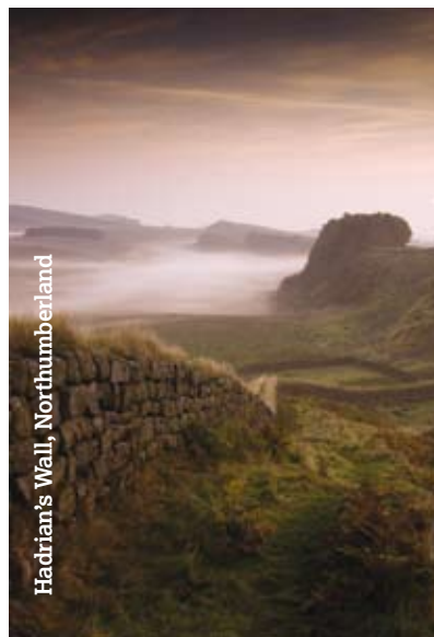
Hadrian's Wall, Northumberland

The Regional Tourism Framework Agreement (RTFA) provides a framework to better connect work across the visitor economy and cultural sectors, and recognises the different statutory responsibilities of public bodies and regulators. The RTFA is an agreement between VisitEngland and the regions. Each region's representatives involved will sign up to work to achieve the agreed outcomes. These agreements will specifically focus on the development of the visitor economy in a region and alignment of activity with the principles and proposed implementation of the Strategic Framework.