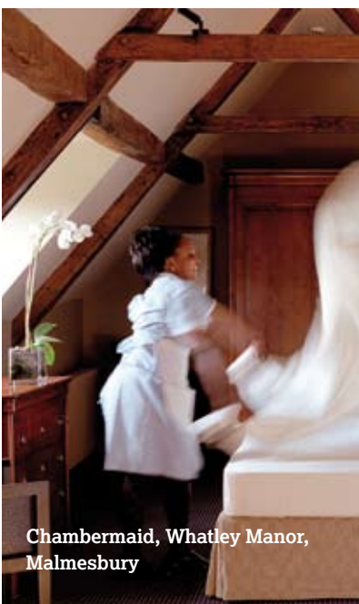
Chambermaid, Whatley Manor, Malmesbury

A communication and engagement plan to promote industry effectiveness will deliver a set of consistent messages at all levels within the industry from national agencies to SMEs. It will also identify the support available to SMEs and where they can go for essential information and advice.