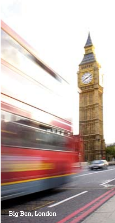
Big Ben, London

One of the greatest opportunities to provide an improved visitor experience is to achieve greater coordination between the visitor and transport providers. Transport in England is a huge sector with many competing stakeholders but England's transport provision does not always compare well with some competitor destinations. Nor do transport planners and policy makers recognise that tourism accounts for 70% of long distance travel in Britain. While there have been improvements in the coordination of public transport, this is set against a background of declining frequency of services – especially in rural areas and in particular with most bus services outside London – and some severe overcrowding on railways. England has suffered from a long-term lack of investment in public transport infrastructure and, although progress is being made, the visitor experience of public transport can be negative. The priority of transport planners is generally to deal with static populations in the areas they serve – residents, local workers, commuters – and visitors are often seen as a secondary consideration and yet nearly one third of all train travel within England is made for tourism and long distance leisure journeys