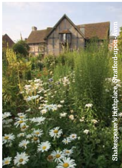
Shakespeare's birthplace, Stratford-upon-Avon

By taking a more holistic approach to destination management the experience and the service standards enjoyed by local people and visitors can be improved