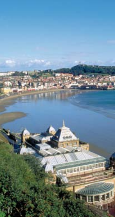
Scarborough Bay, North Yorkshire

VisitEngland, working with ETIP and the TIU, will develop an annual National Research and Intelligence Programme that responds to the need for information on the value of the visitor economy, the opportunities for growth and the industry's performance. Part of this programme will include encouraging the industry to take up information and use it to better inform management planning. This will build on the good work already progressed and look to sustaining the leadership and vision of ETIP and the TIU beyond 2011.